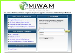
Michigan Web Account Manager